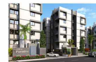
Garden Paradise @ Bopal - 2013