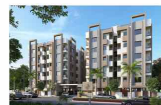
Chevron Plaza @ Motera - 2011