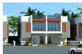
Manipur Greens @ Manipur - 2009