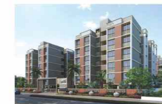
Sun Optima @ Bopal - 2013