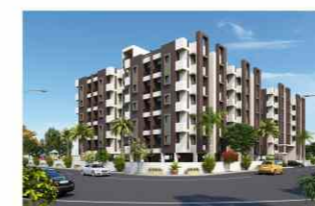
Satatya Avenue @ New Ranip - 2012