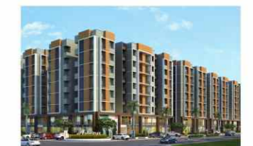
Ashraya-9 @ New Ranip - 2015