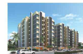
Vinayaka Homes @ Ujala Circle-2015