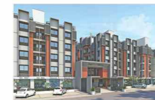
Sun Real Home @ New Ranip - 2012