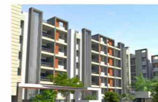
Ashray Gold @ New Ranip - 2011