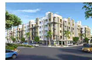
Ashray Platina @ New Ranip - 2011