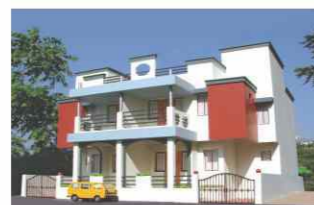
Ghuma-89 @ Bopal - 2008