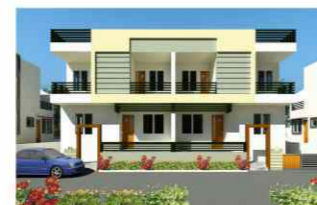
Manipur Elegance @ Manipur - 2010