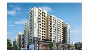
Ashraya-10 @ New Ranip - 2016