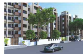
Madhuvan Glory @ Naroda - 2011